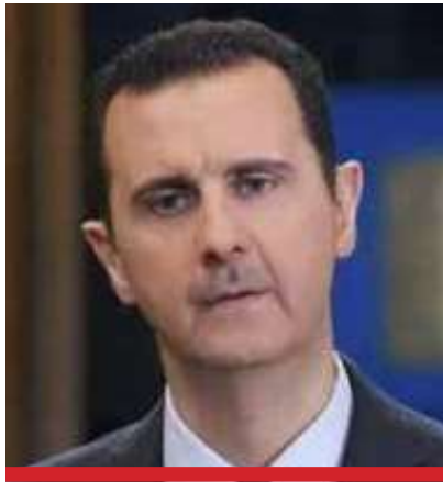
Bashar al-Assad, the Syrian President

Soleimani was a man who loved Palestine and believed that it should be liberated from the clutches of the occupiers.