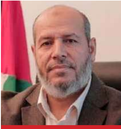
Khalil al-Hayya, Senior Hamas Official

We are thankful to the man who loved Palestine. The visit of Ismail Haniyeh, the head of the Hamas political bureau, to Iran to attend the funeral of General Qasem Soleimani was a sign of loyalty to the man who supported the resistance of the Palestinian people. It was also to declare support for a country that is the friend of our nation and our resistance.